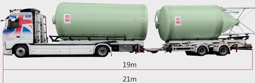
Height: 4.8m, Width: 2.9m, Weight: 22 tonnes approx.

Check for overhead cables, ensure adequate clearance to enable silo erection.