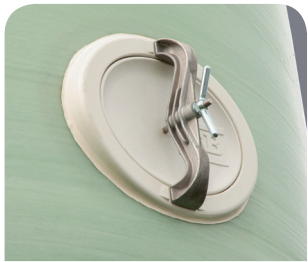
Optional Inspection Hatch

Optional colours available in ANY RAL/BS colour, see examples below: